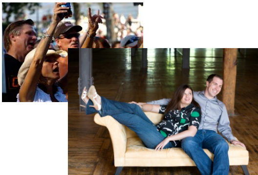
Q106 Morning Show Candy + Potter

Weekly Listeners: 65,000 Median Age: 43 Audience Composition: 57% A25-54 / 42% A18-44 Gender: 43% Male / 57% Female Annual HH Income: 72% $50K + Education: 73% college educated Employment: 78% are employed Home Ownership: 81%